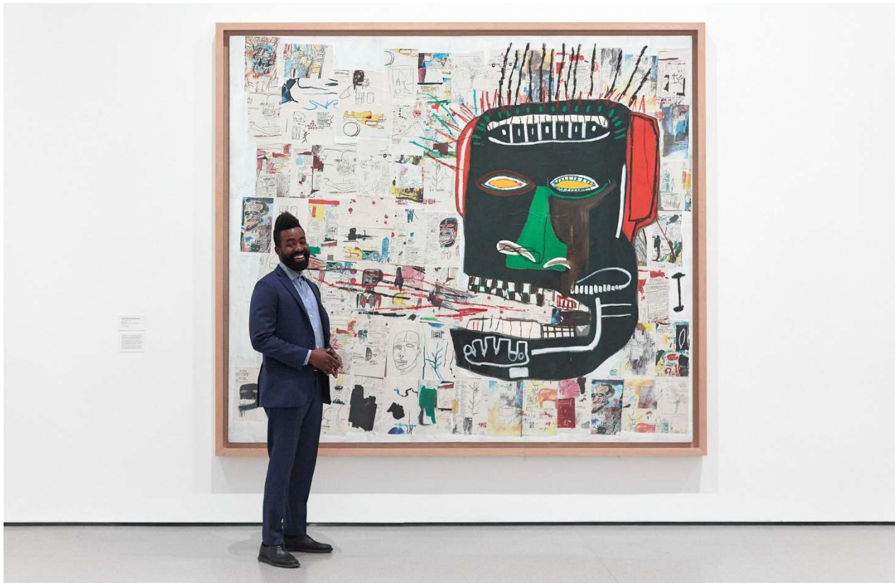
Jean-Michel Basquiat. Glenn. 1985 MoMA

Born in Brooklyn to a Puerto Rican Mother and Haitian Father, Basquiat showed a talent for the arts from an early age. He began painting by creating street art in Lower Manhattan and later moved to the canvasses he is famed for. Basquiat was known to have collaborated with famed Pop Artist, Andy Warhol on occasion, though not among his best-known or loved works.