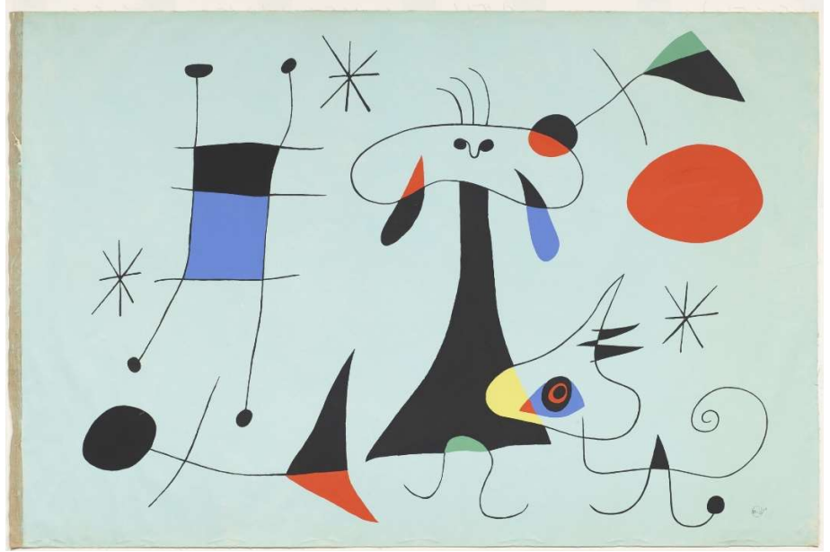
Pictured: Joan Miró 1955. [Left] and Joan Miró The Sun (El Sol) 1949. [Right]

Joan Miró was born in Spain in 1893. Perhaps not a surprise he was a far better artist than student. At 14 he enrolled in the School of Industrial and Fine Arts (the Llotja), and, to please his parents, the School of Commerce in Barcelona. The strain of his studies caused him to suffer a nervous breakdown. Shortly after, he contracted a severe case Typhoid Fever and while recovering devoted himself solely to his art.